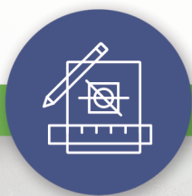
Renders and Sketches