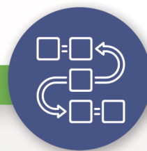
Integration with Site